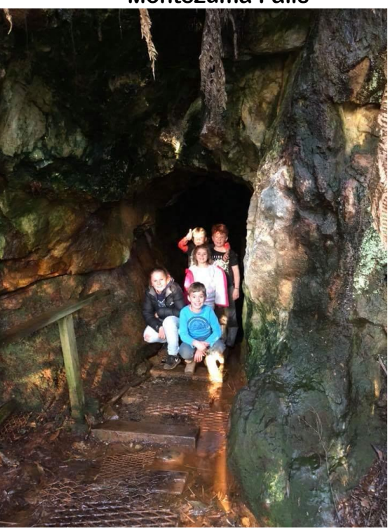
Kids in a hole