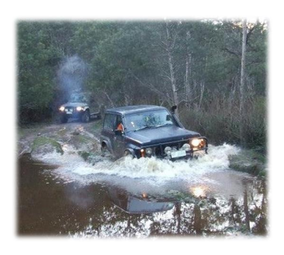
SUBS ARE DUE!